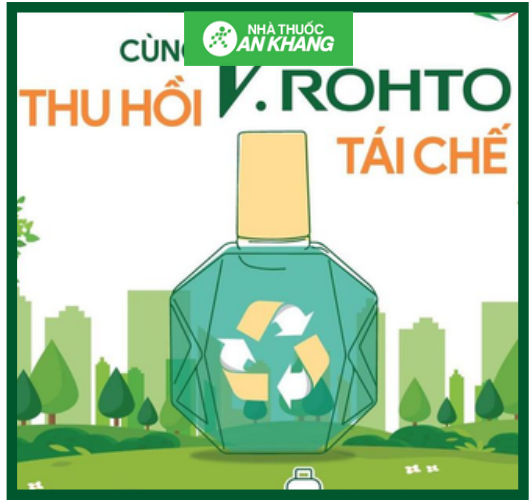
Recycling of Empty V.Rohto Eye Drops Bottles" Program