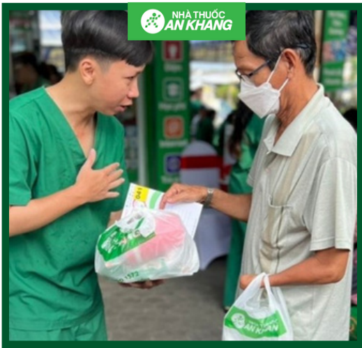
"Tam An Than Khang" Journey #18: Cà Mau