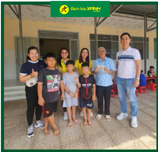
Charity Program from Can Tho to Hau Giang at Kim Hong Shelter and Thien An Shelter